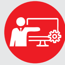
Training on Software Development